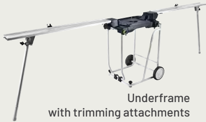
Underframe with trimming attachments

Limitless mobility: Small, compact, lightweight with handles in all the right places for quick and easy set up and pack up.